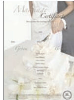
Cut the Cake

With each order for a commemorative marriage certificate package, you will receive a standard marriage certificate. Commemorative marriage certificates do not contain security features and organisations may not accept them as a proof of identity document. See separate Fees for Products and Services flyer.